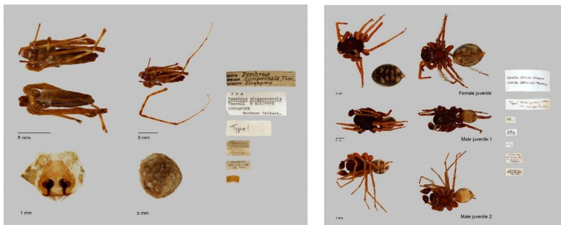
Specimen images of Psechurus singaporensis (NH.1901.144.341) (left) and Storena juvenca (NH.1901.144.32) (right).